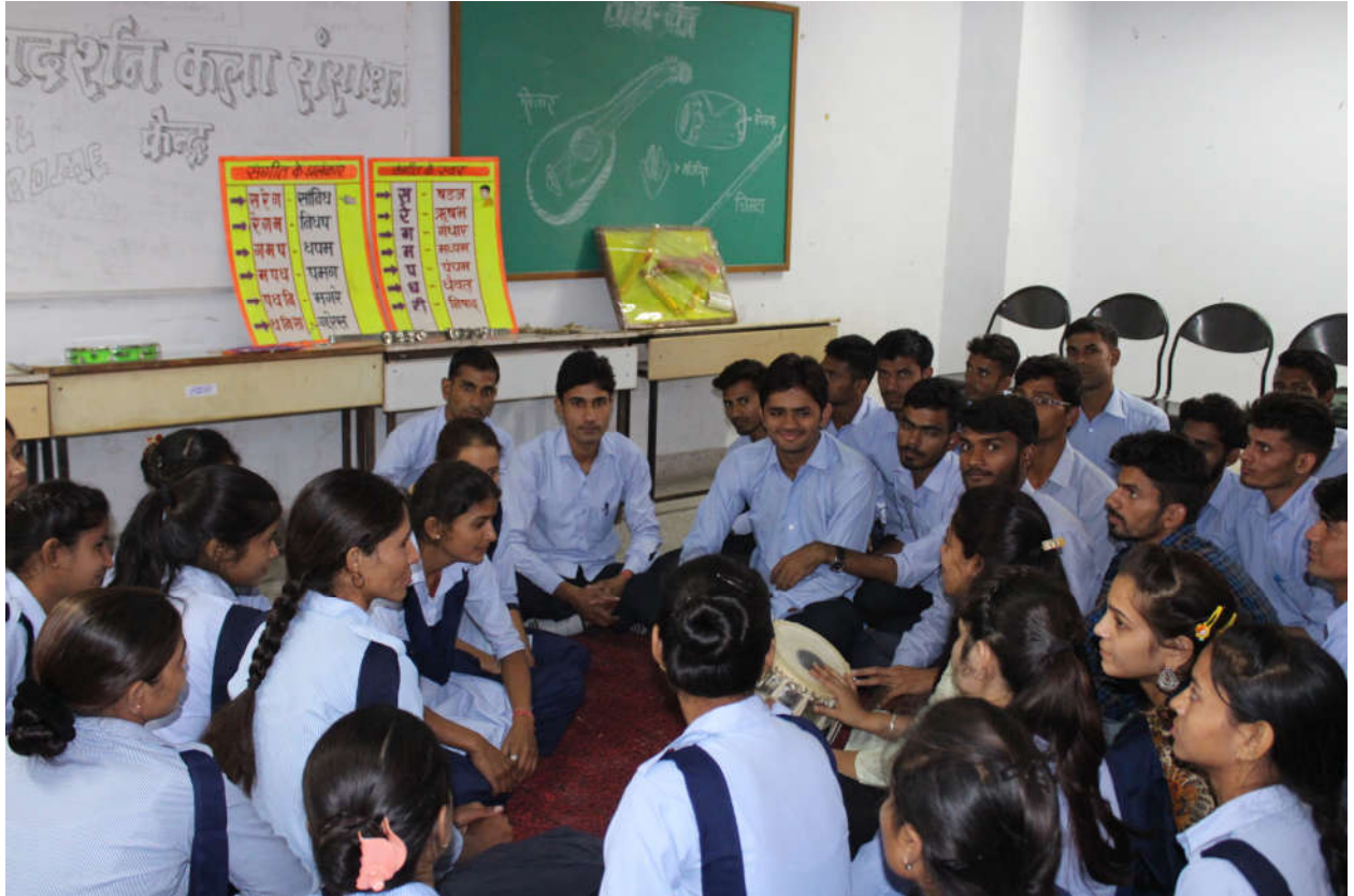
Performing Art Lab