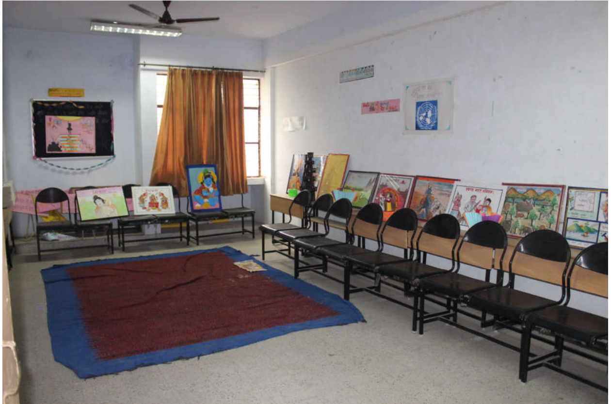
Art and Carft Lab