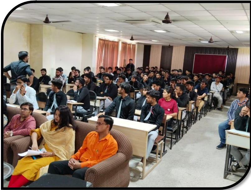
Audience keenly listening to the speaker