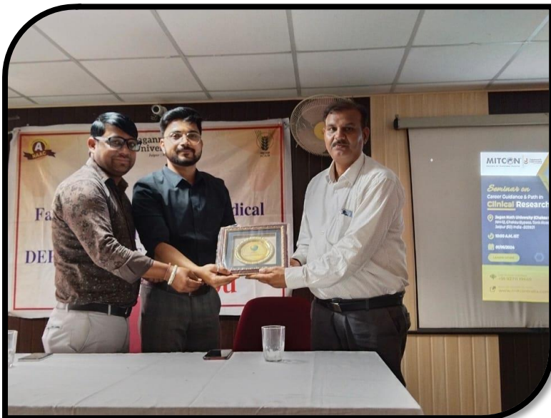
Respected HOD Sir giving the vote of thanks to the chief speaker