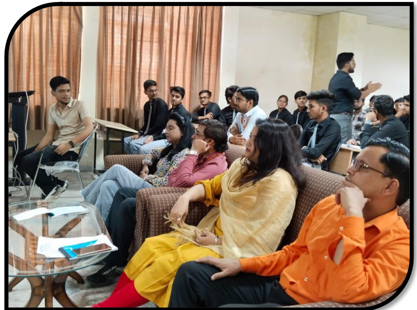
Audience keenly listening to the speaker